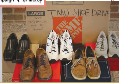
(above left) The Compassion Pantry sign outside of the room on campus (above right) Shoes that have already been donated to the shoe drive sit in front of the donation box.